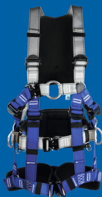
IKAR Two Point Fall Arrest Harness for suspended work IK G4 DW