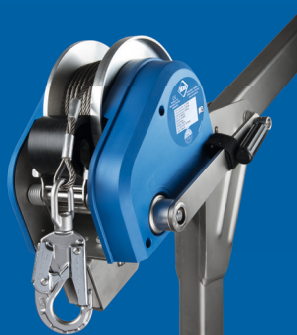
IKAR personnel and load winch PLW Order No: 41-PLW