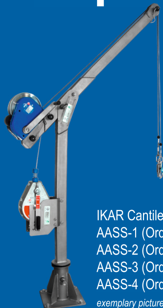
IKAR Cantilever arms: AASS-1 (Order No: 41-57V4) AASS-2 (Order No: 41-59V4) AASS-3 (Order No: 41-60V4) AASS-4 (Order No: 41-62V4)