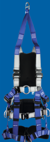
IKAR Two Point Fall Arrest Harness for suspended work with overhead rescue attachment